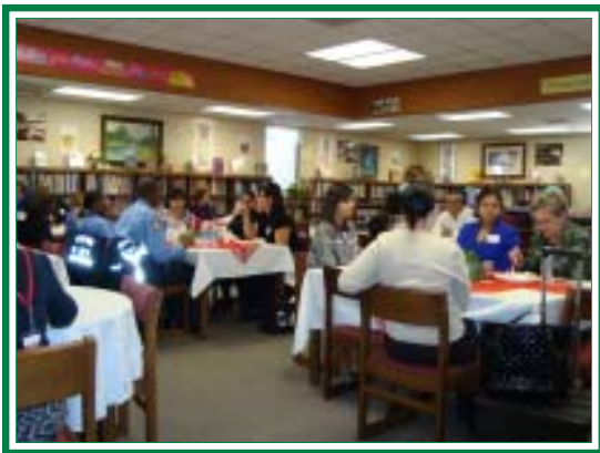
Career Representatives enjoy lunch during Career Day 2008