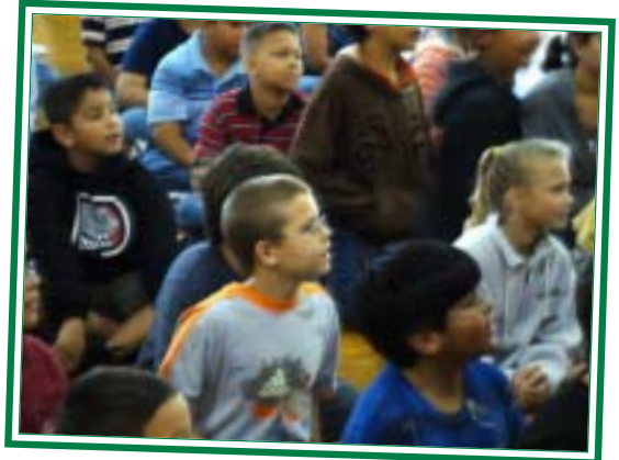
East Side students look on and wait their turn to win a prize.