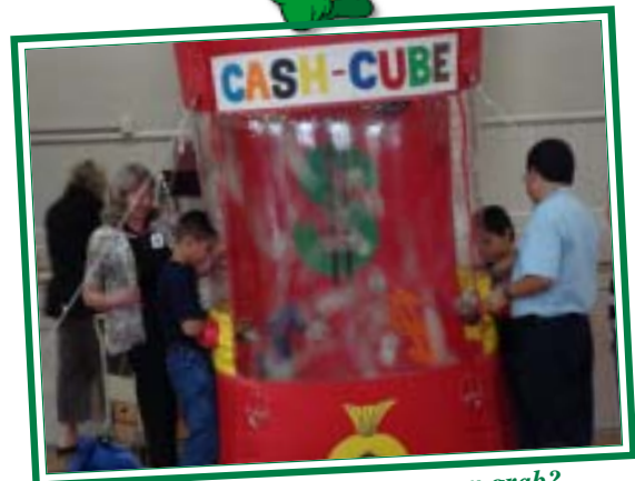
How much money can you grab?