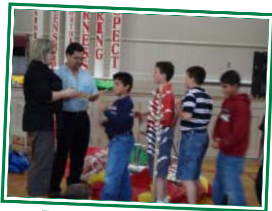
East Side students get in line for a cool prize.