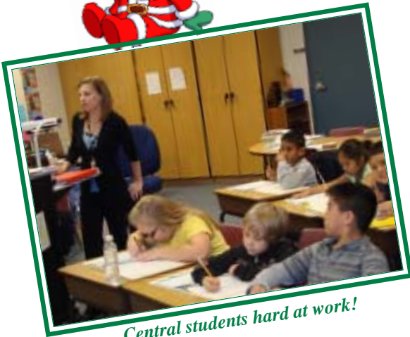
Central students hard at work!