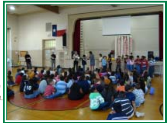
East Side students celebrating a successful fundraiser.