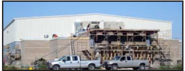
Pictured: new gymnasium under construction

One of the demands on education is the forever growing system of technology. PISD must ensure all facilities are capable of meeting the requirements for installation, electrical usage and upgrading required systems for updated technology. The committee also inspects all facilities for structural integrity, safety, wear, possible repairs, and studies the cost of meeting all of these demands being placed on education and PISD. PISD is constantly looking towards the future and how each change will affect our students. The future is our students and PISD wants to ensure every effort is considered to ensure the continued growth and success for all members of Palacios ISD.